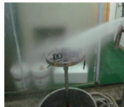
High Pressure Water: 10000KPa