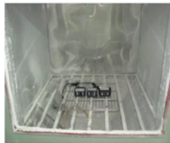
High Pressure Air (Test Sealing)

Most makers recently only test their cameras in 1M water in 1 hour or less at QC stage. According to our 5-years after sales service records, water immersing tested cameras will contribute 3-5% damage rate during daily use within the warranty.